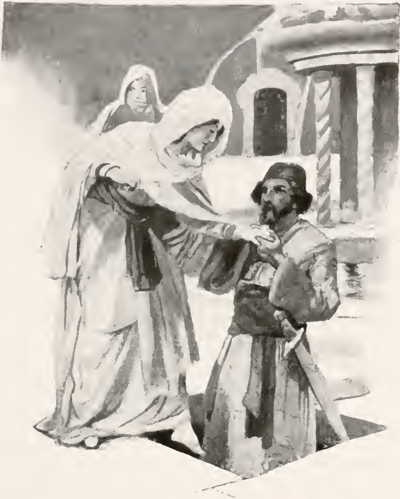
Mustapha and the rescued girls slipped through the opening (P. 55.)

the fountain; having raised one of the flag-stones they would find themselves in the inner courtyard. They would see two towers to right and left of them and, passing through the sixth door from the right hand tower, they would come into the room where the real Fatima and Zoraida were shut up, watched by two black slaves.